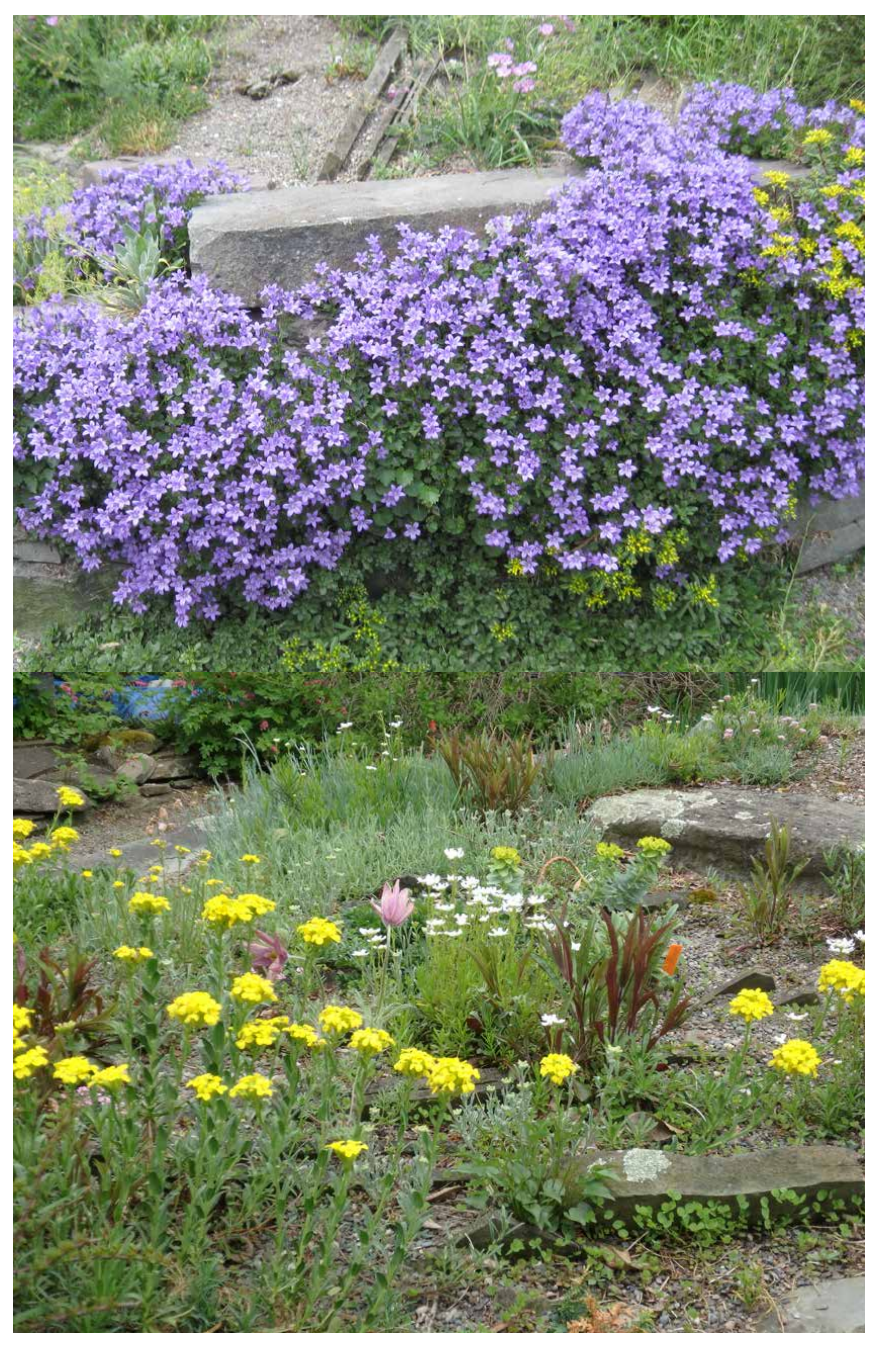
Top: a campanula finds rootholds in the crevices of the dry stone wall. Bottom: The meadow portion of the garden in spring bloom.