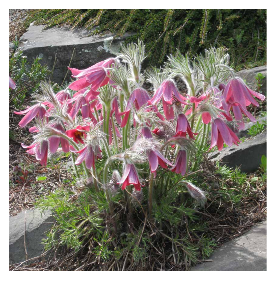
Pulsatilla vulgaris, a most welcome self-seeder.

The garden also has a bog and a series of graduated waterfalls that cascade into an existing water feature. In 2002, we added a sixth component, a hypertufa trough.