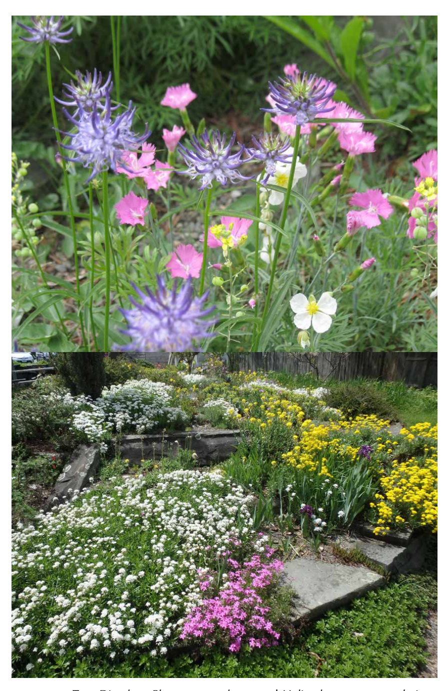
Top: Dianthus, Phyteuma cordatum and Helianthemum nummularium. Bottom: Iberis sempervirens exhibited a bit too much exuberance and has since been restrained; others pictured include Iris pumila, phlox, and Aurina saxatilis.