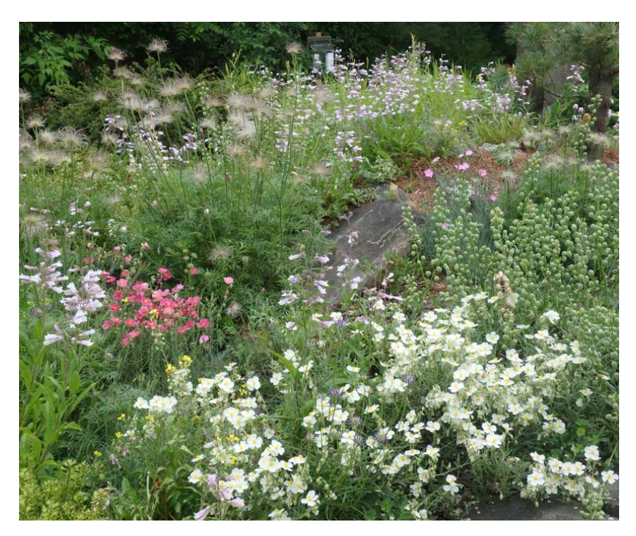
The meadow garden in full bloom.

The Al Wurster Memorial Rock Garden is located at the offices of Tompkins County Cooperative Extension in the city of Ithaca. Attendees of the 2020 Conference may choose to visit this garden in their free time.