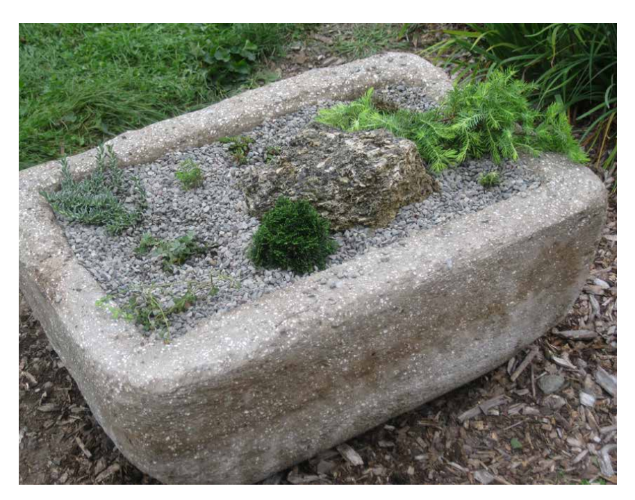
Newly planted trough built and added to the garden in 2012.