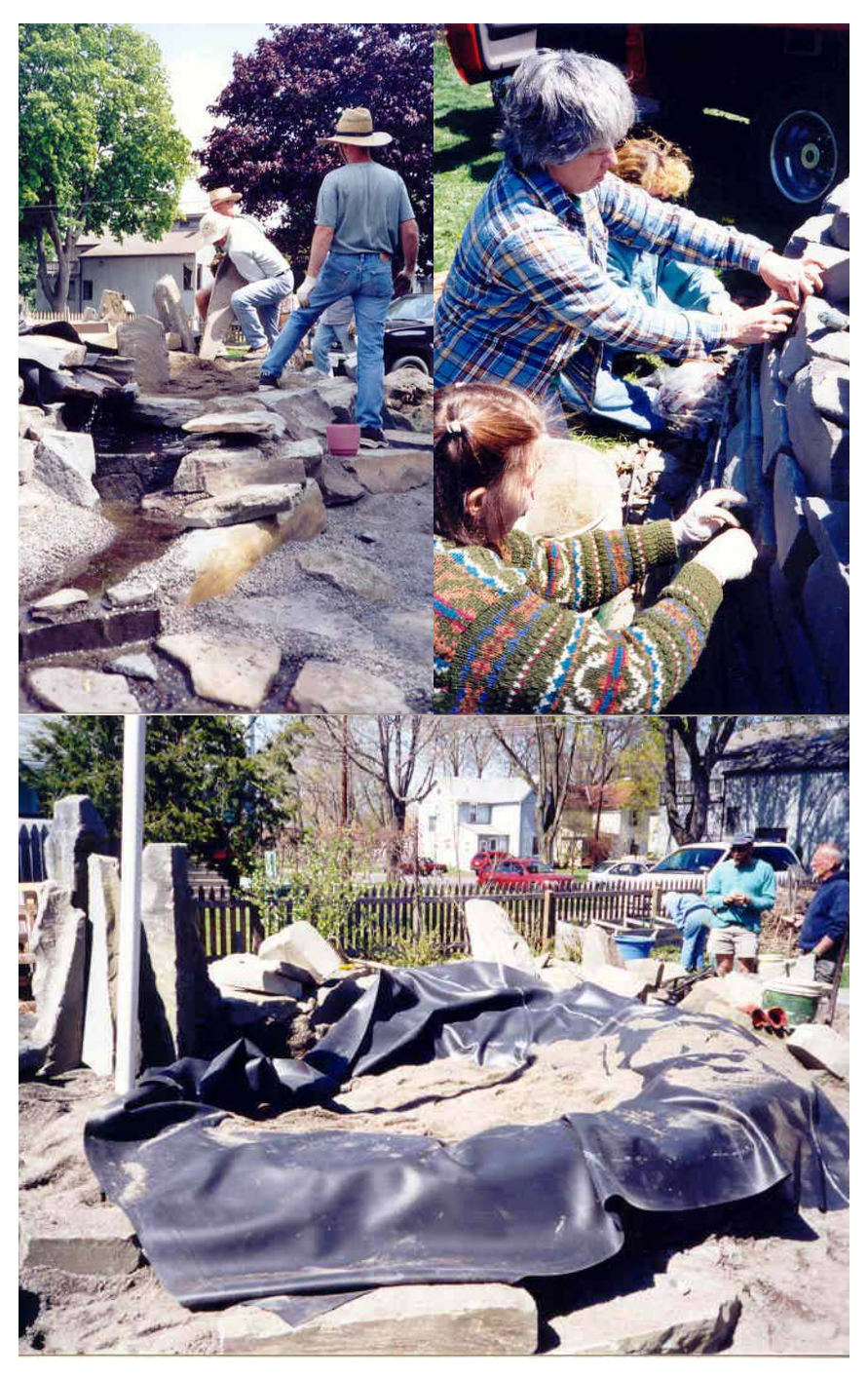
Chapter members hard at work building the rock garden.