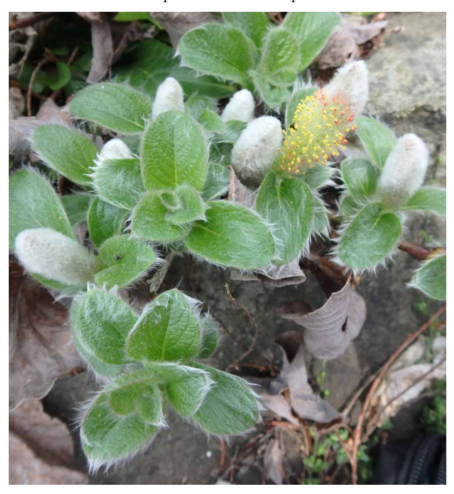
Salix nakamurana var. yezoalpina thriving in the bog area.

Some years we have struggled to find enough volunteers. In those years, the garden has gone a bit wild with rogues self-sowing at will. They do provide a floriferous show (and the public is none the wiser) but the smaller plants struggle to compete. In the long run, it has made for more work and expense as we cull the rogues that have become unwelcome weeds and replant more desirable plants.